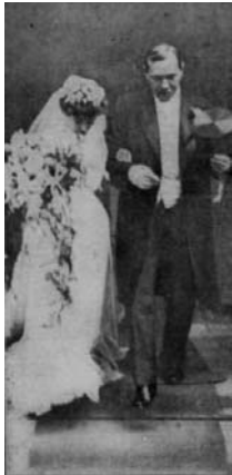
Sir Arthur Conan Doyle and Jean Leckie Doyle on their wedding day