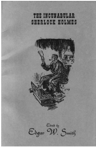
The Incunabular Sherlock Holmes