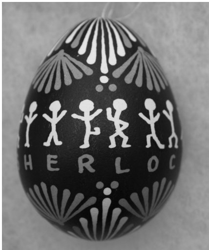
A Sherlockian Egg