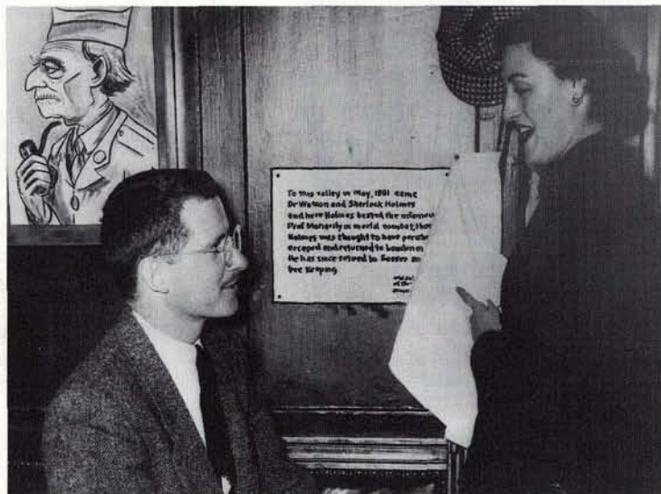
From the Rabe Collection