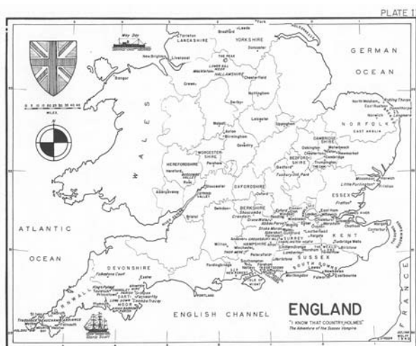
Dr. Julian Wolff's map of England from The Sherlockian Atlas

such as pictographs of stories or coats of arms of Canonical personages along the borders. Expanses of ocean are dotted with illustrations of Canonical ships. Horizontal format maps in the atlas are reproduced at approximately 8" by 6", and vertical format maps are reproduced at approximately 4 1/2" by 7".