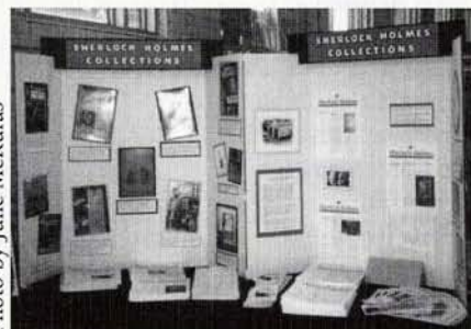
Sherlock Holmes Collections display at the Midwest Bookhunters Bookfair