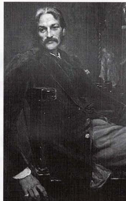
Andrew Lang, from his book Adventures Among Books published in 1905